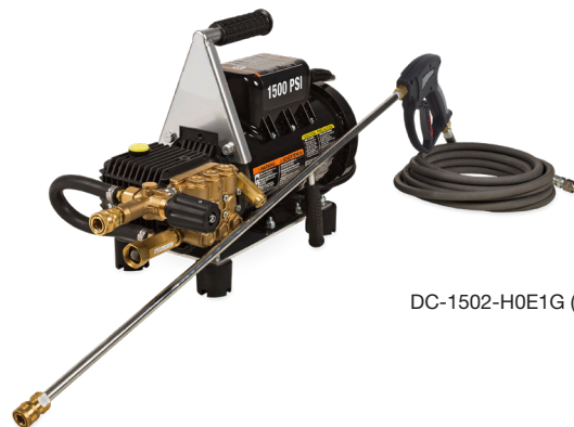
DC-1502-H0E1G (Hand Carry)